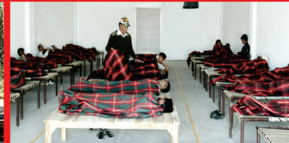
Truck Driver in "Driver Seva Kendra"

As a corporate we have always believed that giving back to the society & nation is very important, especially to the neglected citizens of our country. Hence as a CSR initiative APML started "APM Driver Seva Kendra" at Dudu, NH-8, Jaipur to reduce the highway accidents caused due to the lack of rest & sleep by Truck Driver. For last 2 years, this Kendra alone has been able to save 41 lives each month, by providing rest & sleep to more than 15000 drivers per month.