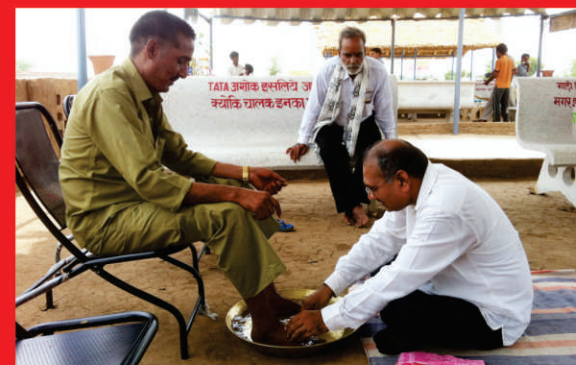
Welcome on arrival.... by washing driver's feet

As a corporate we have always believed that giving back to the society & nation is very important, especially to the neglected citizens of our country. Hence as a CSR initiative APML started "APM Driver Seva Kendra" at Dudu, NH-8, Jaipur to reduce the highway accidents caused due to the lack of rest & sleep by Truck Driver. For last 2 years, this Kendra alone has been able to save 41 lives each month, by providing rest & sleep to more than 15000 drivers per month.