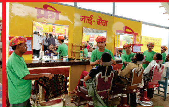
Free Shaving & Cutting Facility