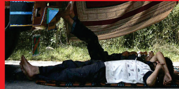
Truck Driver on Road